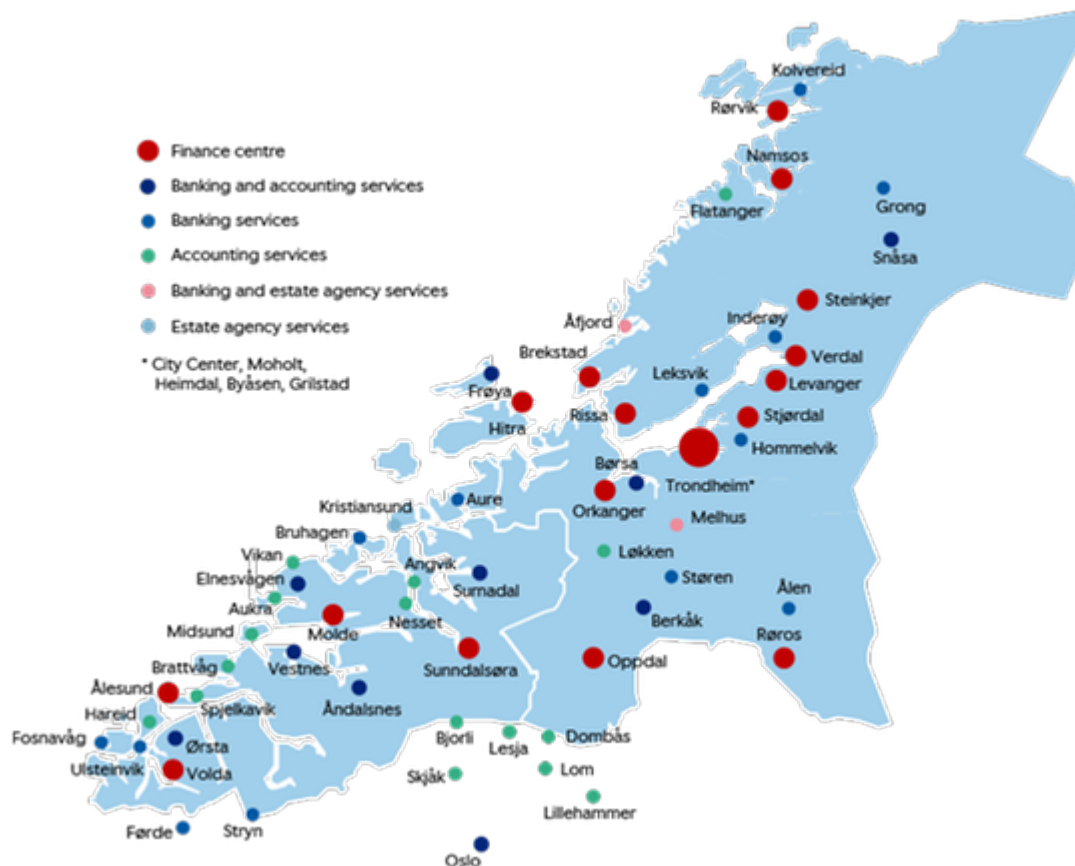
Figure 2: Overview of SpareBank 1 SMN's offices

The group's head office is located in Trondheim along with a number of offices offering banking, accounting and estate agency services on a stand-alone or co-located basis.