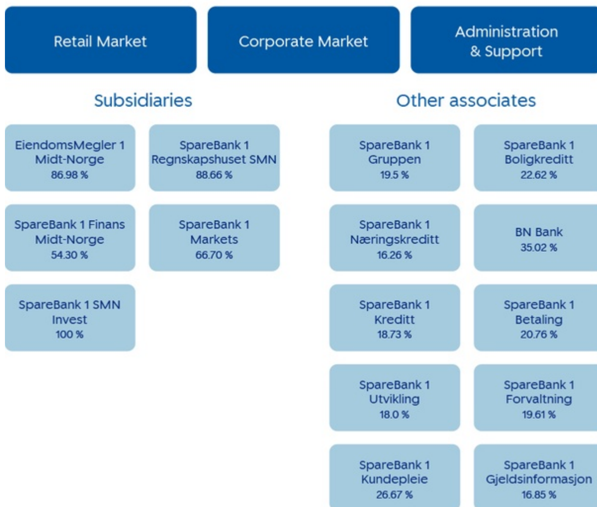
Figure 1: Overview of business lines in SpareBank 1 SMN